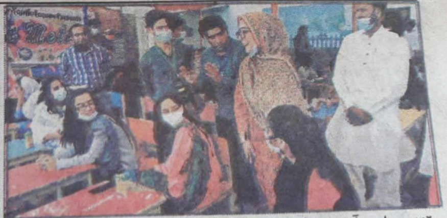
تندبوجام: آرٽ ميلي ۾ شاگردياڻيون ۽ شاگرد شريڪ آهن

ميونسپل ملازم فوٽ ٿي ويو حادثي ۾ ٻيو ڏسو صفحو 2 ڪالم 4